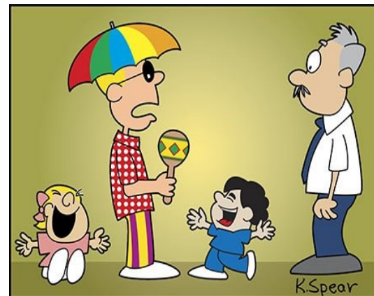
“Apparently, my spiritual gift is being silly with the toddlers.”

As we consider how we can be the Church throughout the month of October, I invite you to consider what gifts God has given you. Wisdom? Knowledge? A knack for administration? Passion and creativity? The ability to cultivate meaningful relationships? A hobby or talent that you can use to serve others?